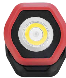
WTB100 Small (80mm)