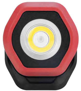
WTB115 Large (100mm)